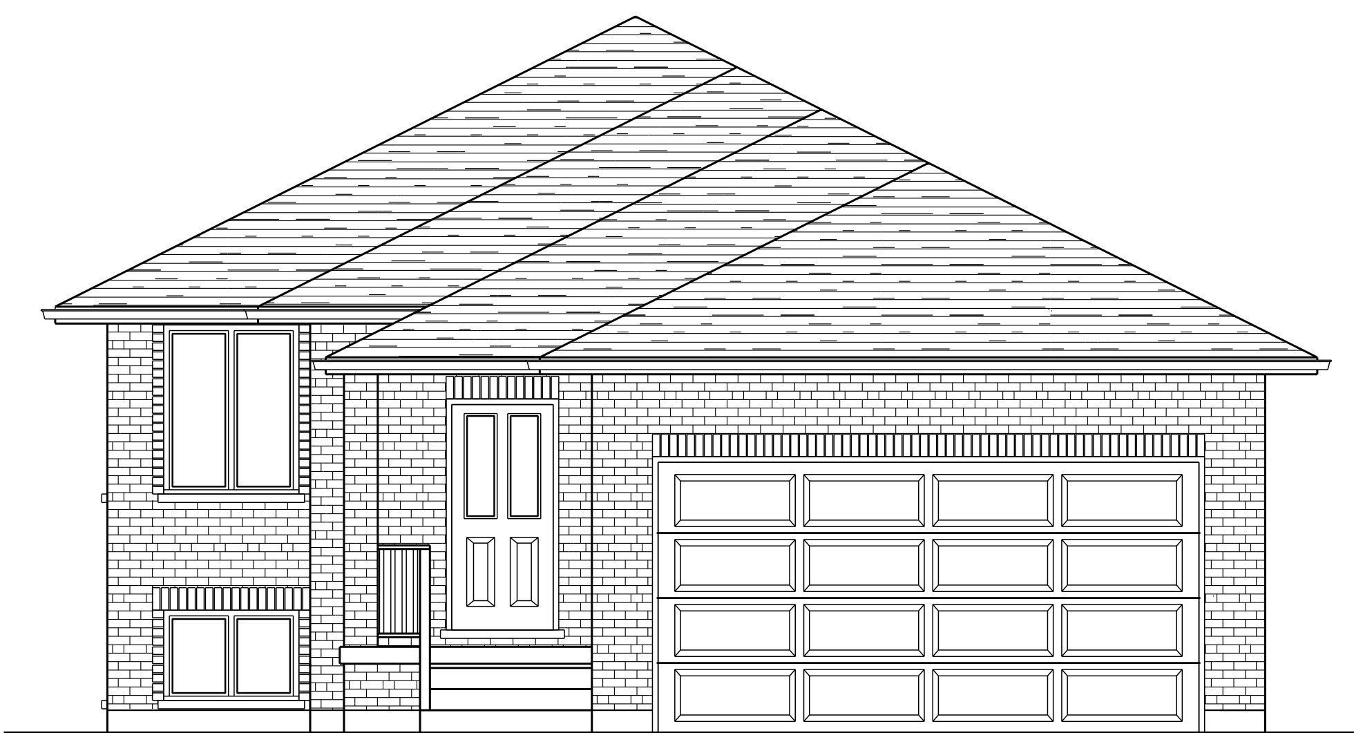
FRONT ELEVATION LOTS # 44, 45