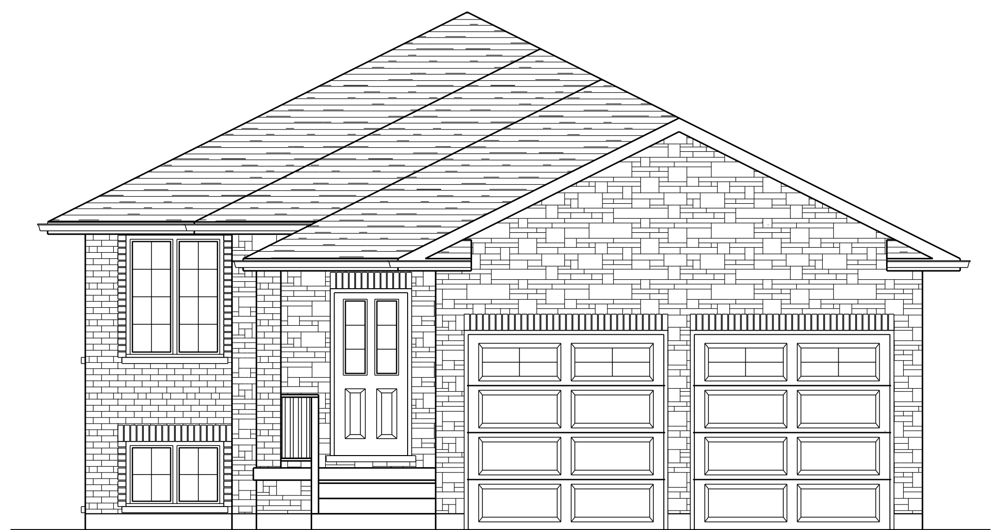
FRONT ELEVATION UPGRADED LOT # 39