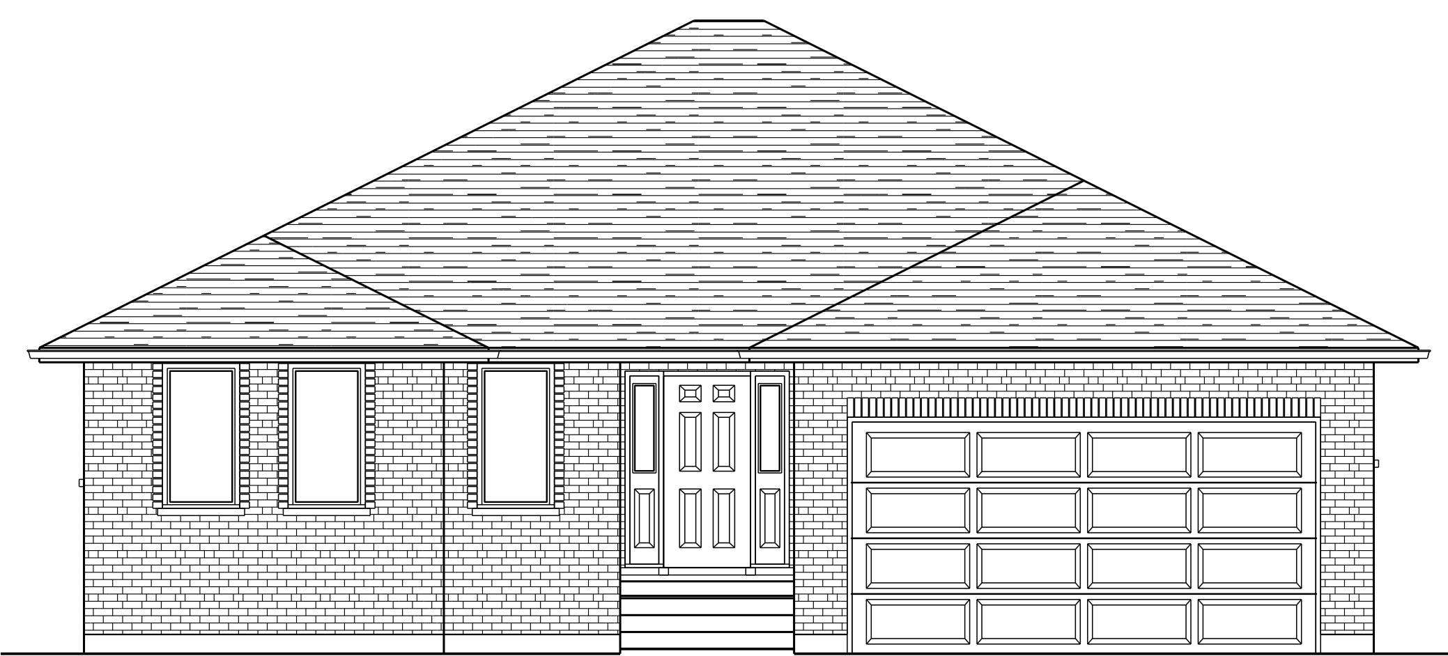
FRONT ELEVATION LOTS # 20, 23, 26