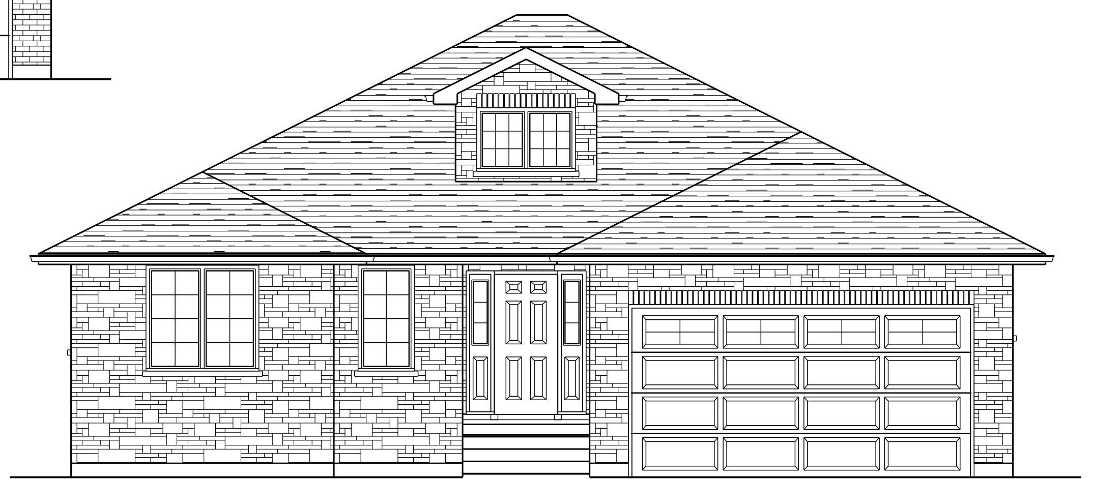
FRONT ELEVATION UPGRADED LOTS # 28, 33