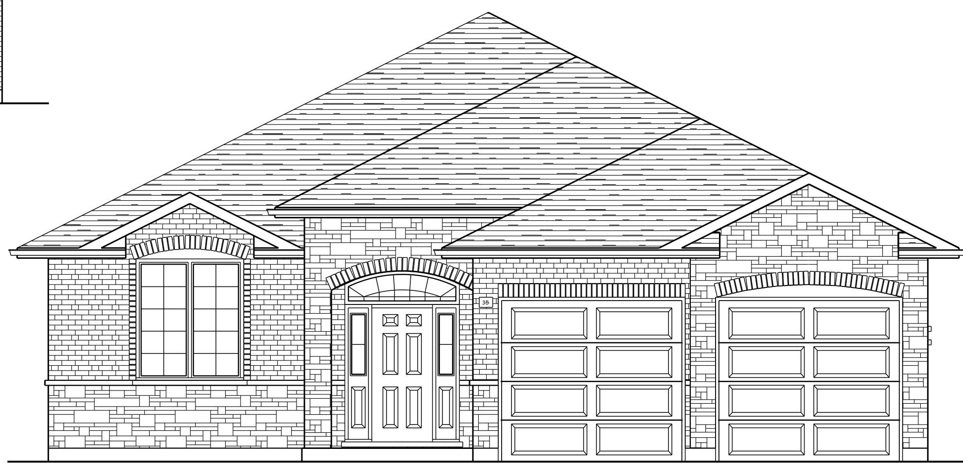
FRONT ELEVATION UPGRADED LOTS # 22, 29