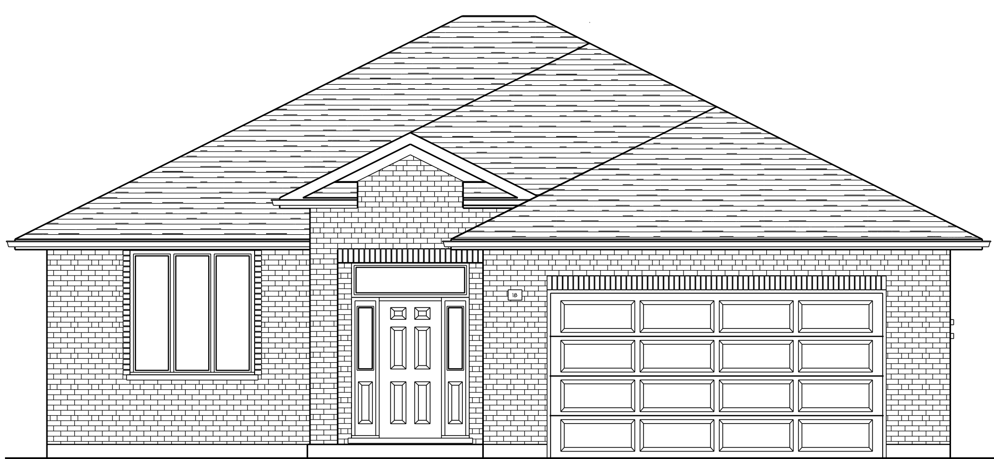
FRONT ELEVATION LOTS # 25, 31