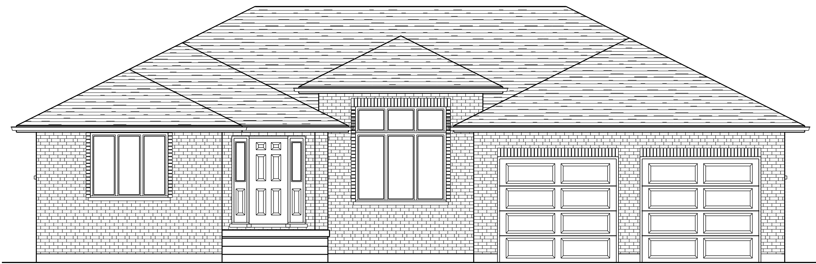
FRONT ELEVATION LOT # 35