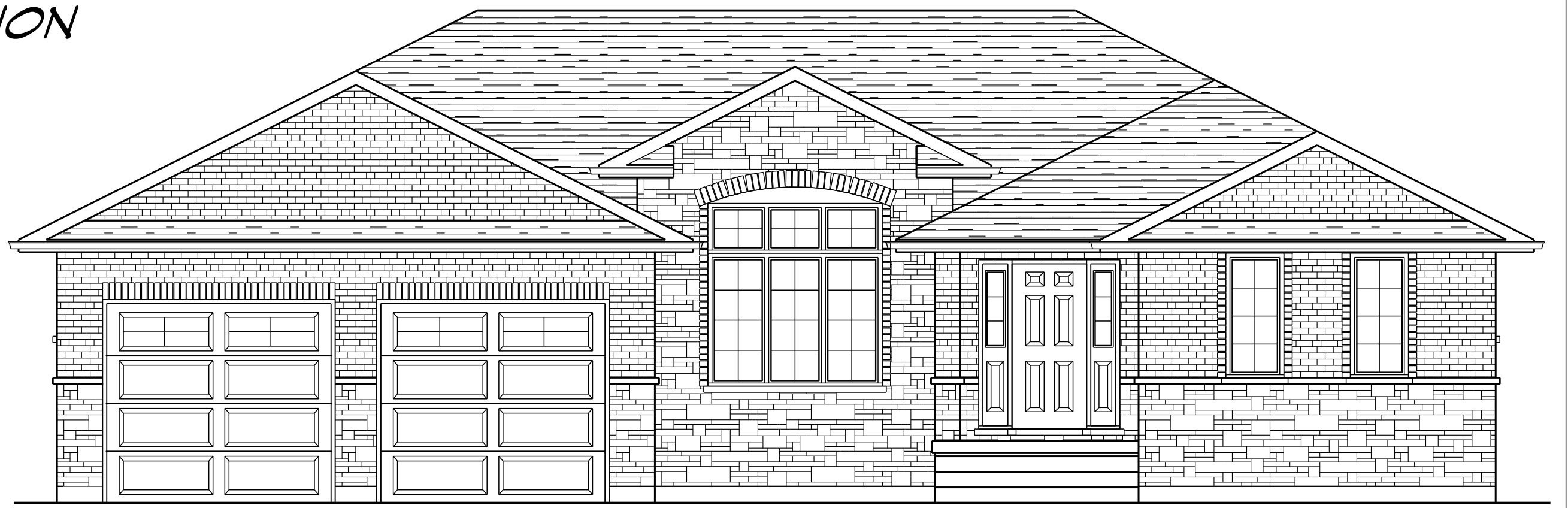
FRONT ELEVATION UPGRADED LOT # 34