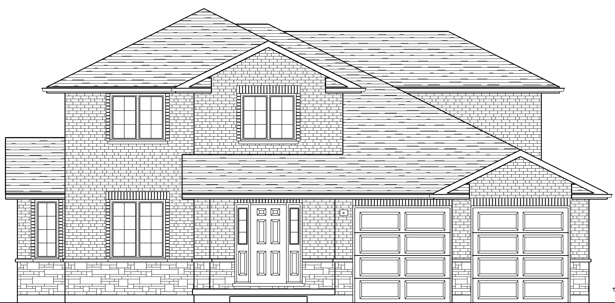
FRONT ELEVATION LOT # 16