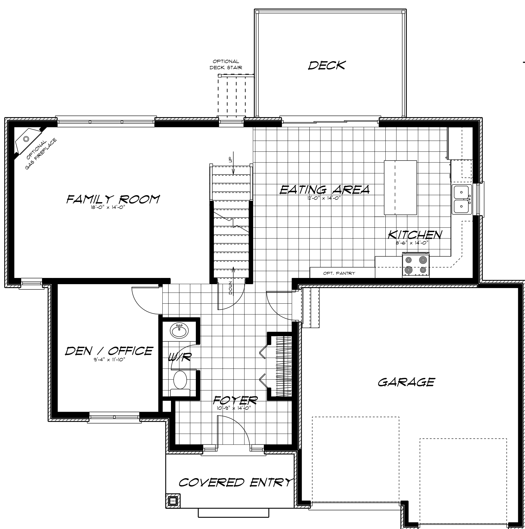
MAIN FLOOR PLAN 1,014 SQ.FT. MAIN FLOOR AREA