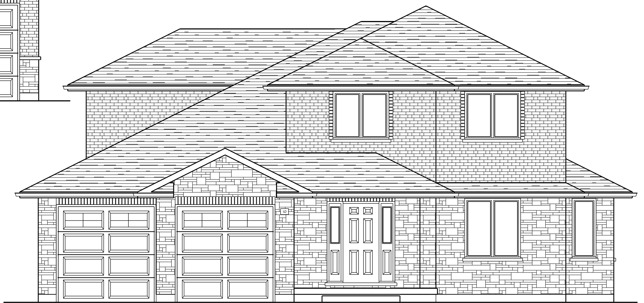
FRONT ELEVATION UPGRADED LOT # 14