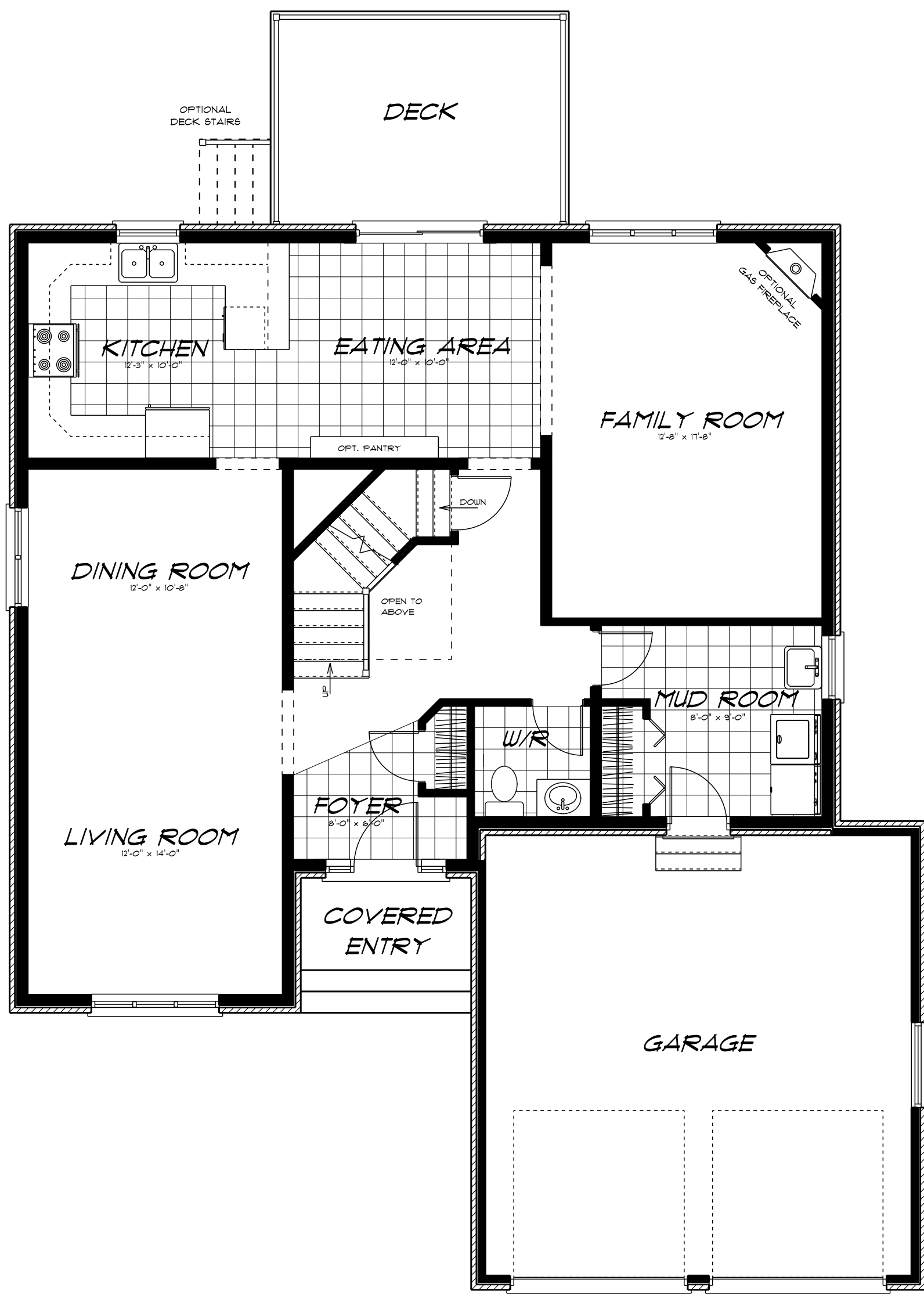
MAIN FLOOR PLAN 1,250 SQ.FT. MAIN FLOOR AREA