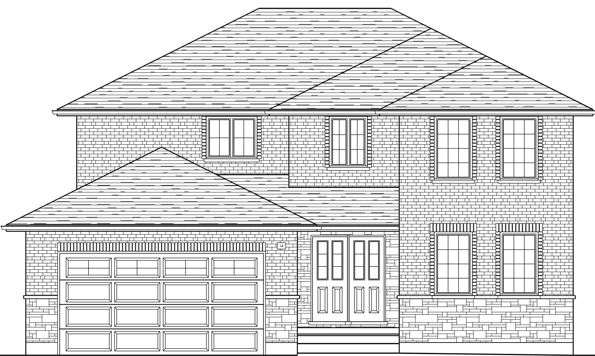
FRONT ELEVATION LOT # 12