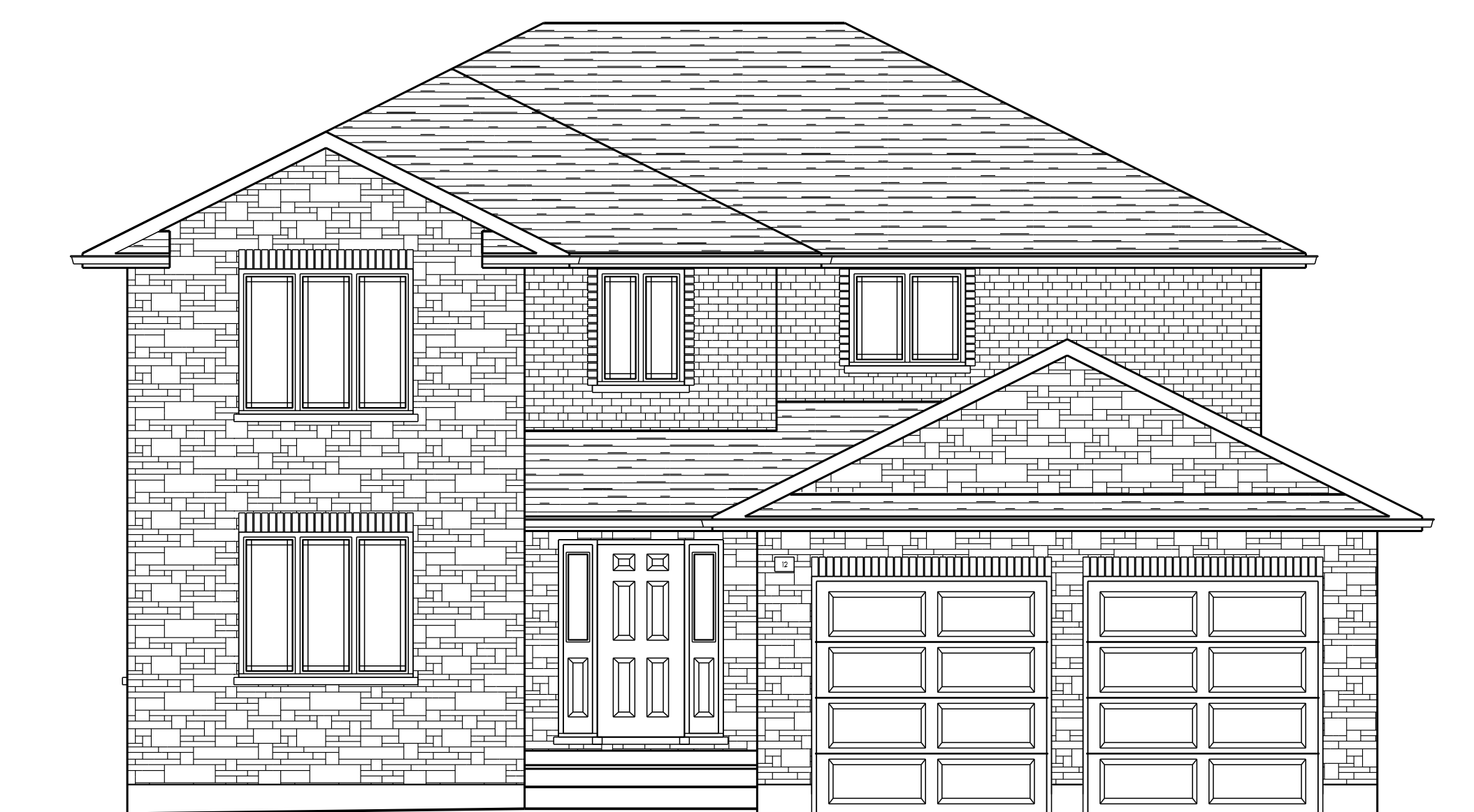
FRONT ELEVATION UPGRADED LOT # 13